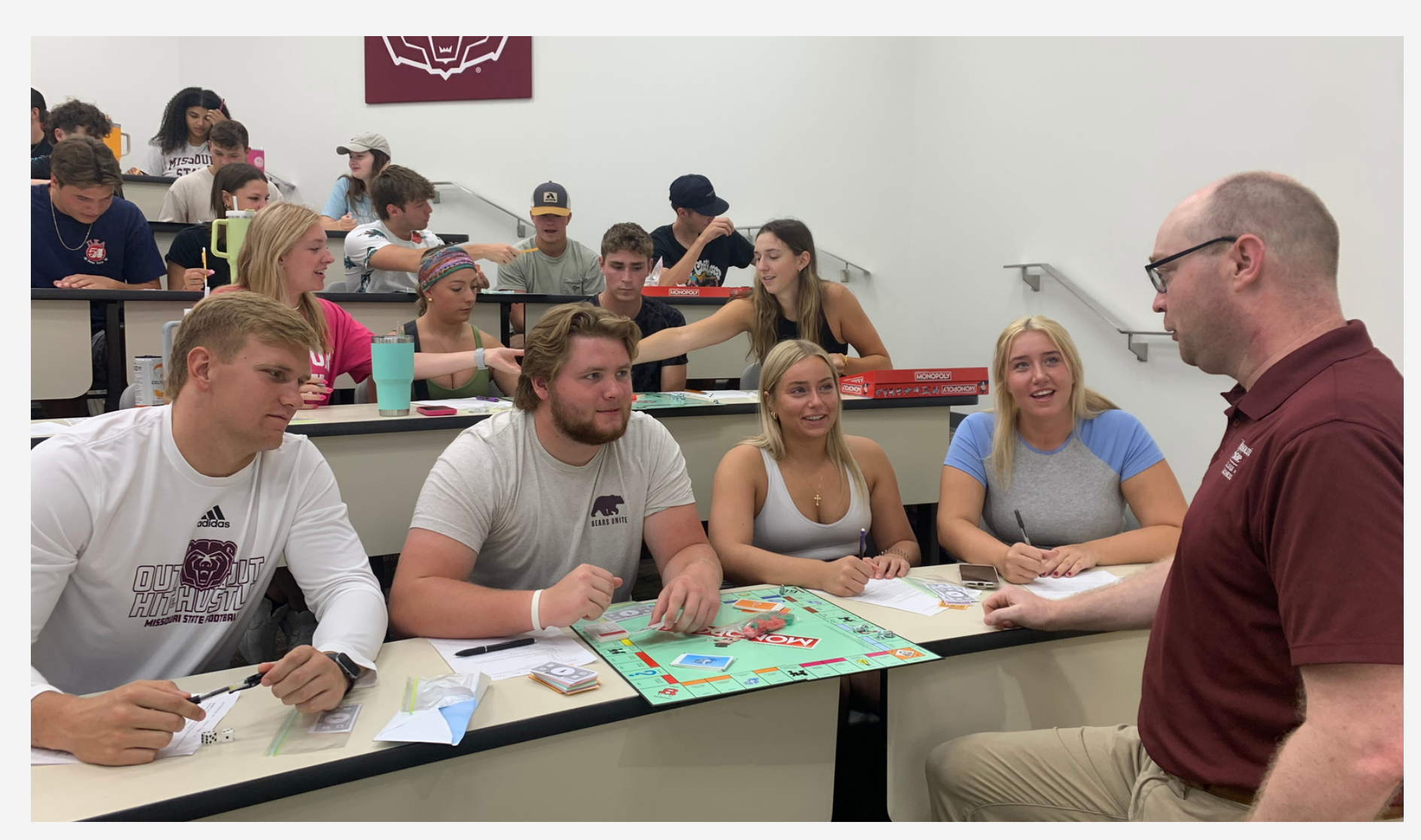
Each Monopoly transaction is recorded!

Students are broken up into groups and start the game off like normal. But each event that happens must be recorded as a journal entry!