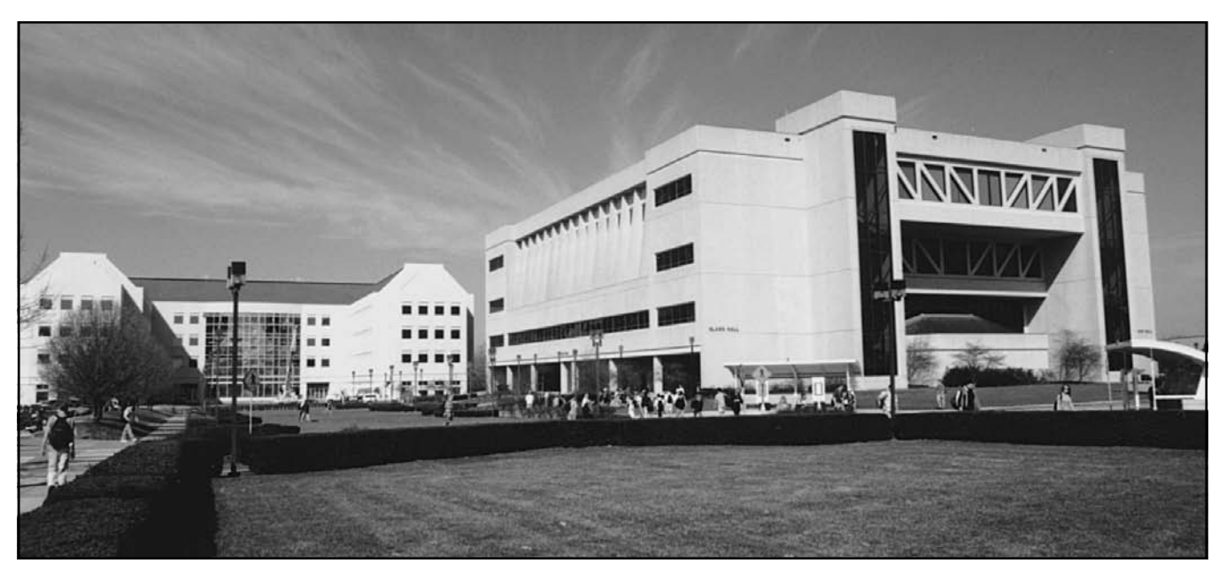
David D. Glass Hall in foreground. Strong Hall in background.

Email: CollegeofBusinessAdministration@missouristate.edu