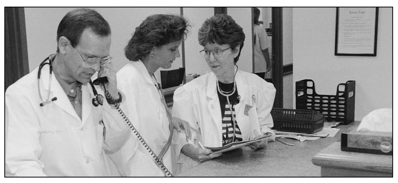
Taylor Health and Wellness Center.