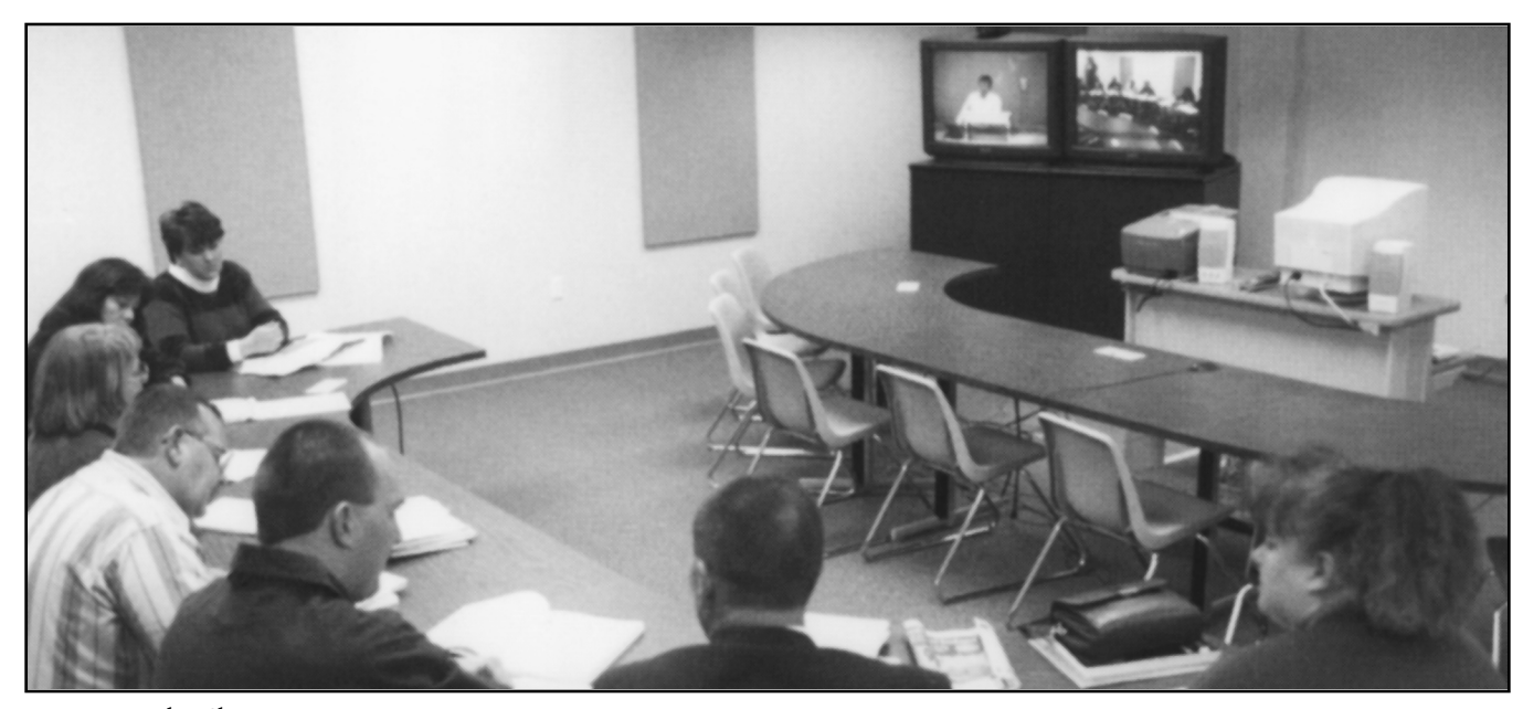
Interactive Video Classroom.