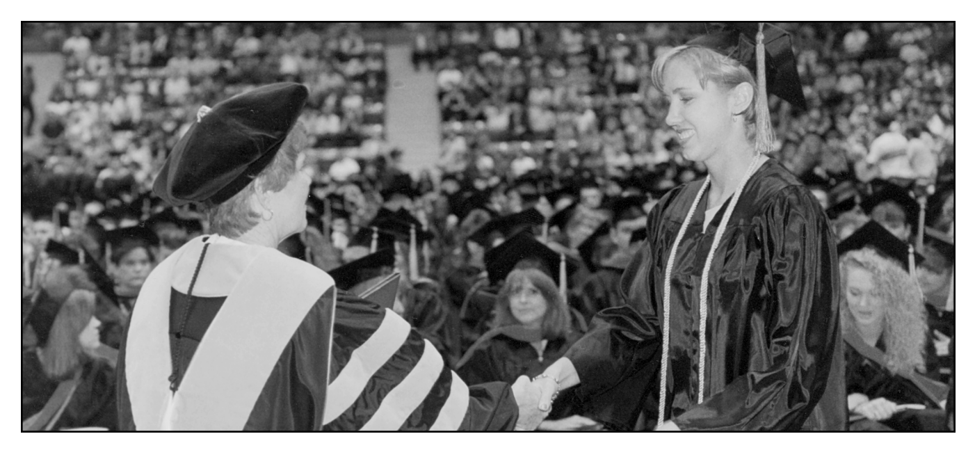
The primary mission of the University is to develop educated persons.