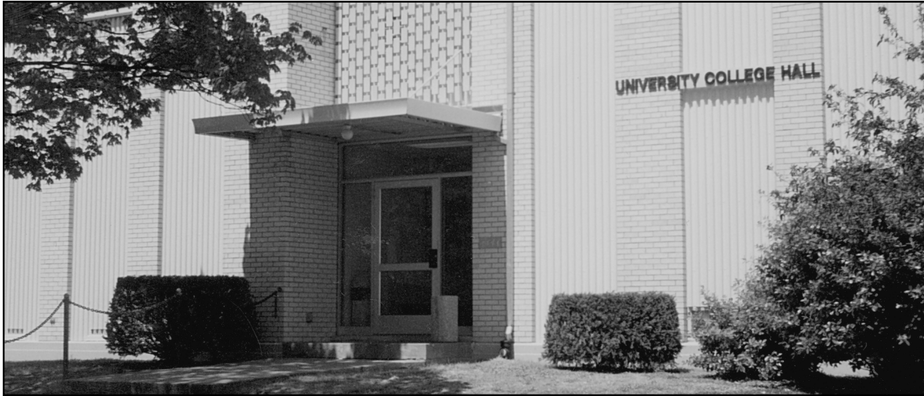
University College Hall.

115 University College Hall, Phone: 836-6370, FAX: 836-6372 Email: Ucollege@smsu.edu