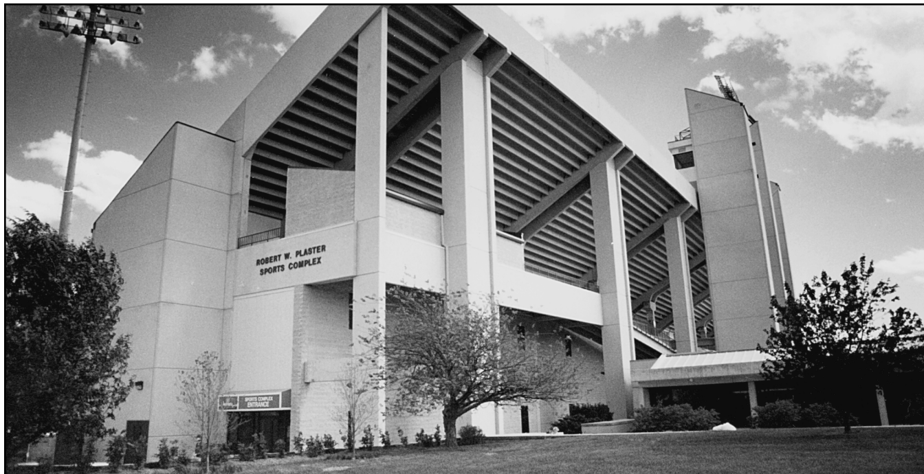
Robert W. Plaster Sports Complex