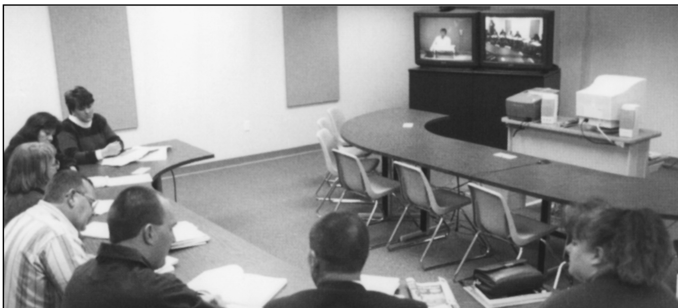
Interactive Video Classroom.