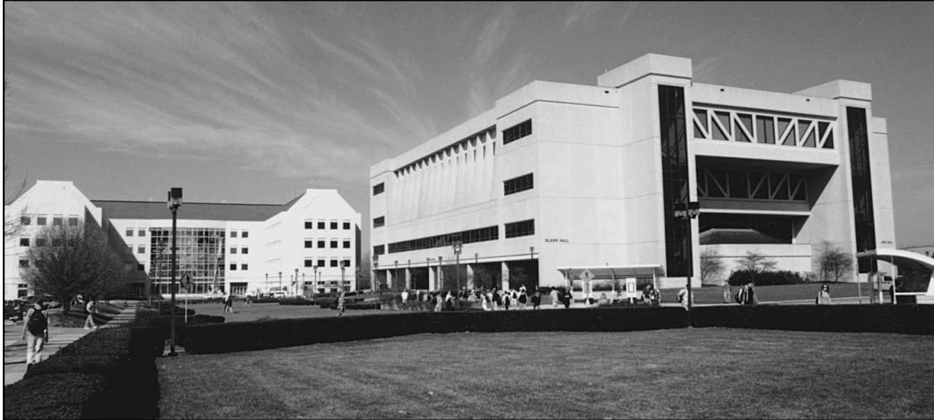
David D. Glass Hall in foreground. Public Affairs Classroom Building in background.

400 Glass Hall, Phone: 836-5646, FAX: 836-4407 Email: CollegeofBusinessAdministration@smsu.edu