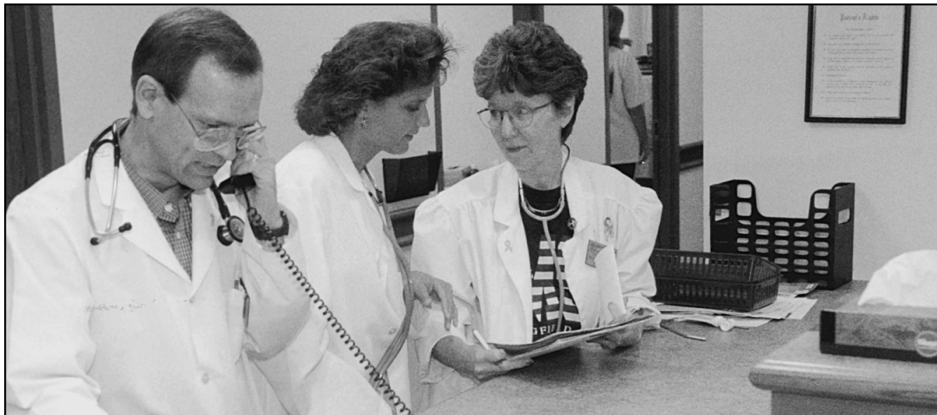
Taylor Health and Wellness Center.