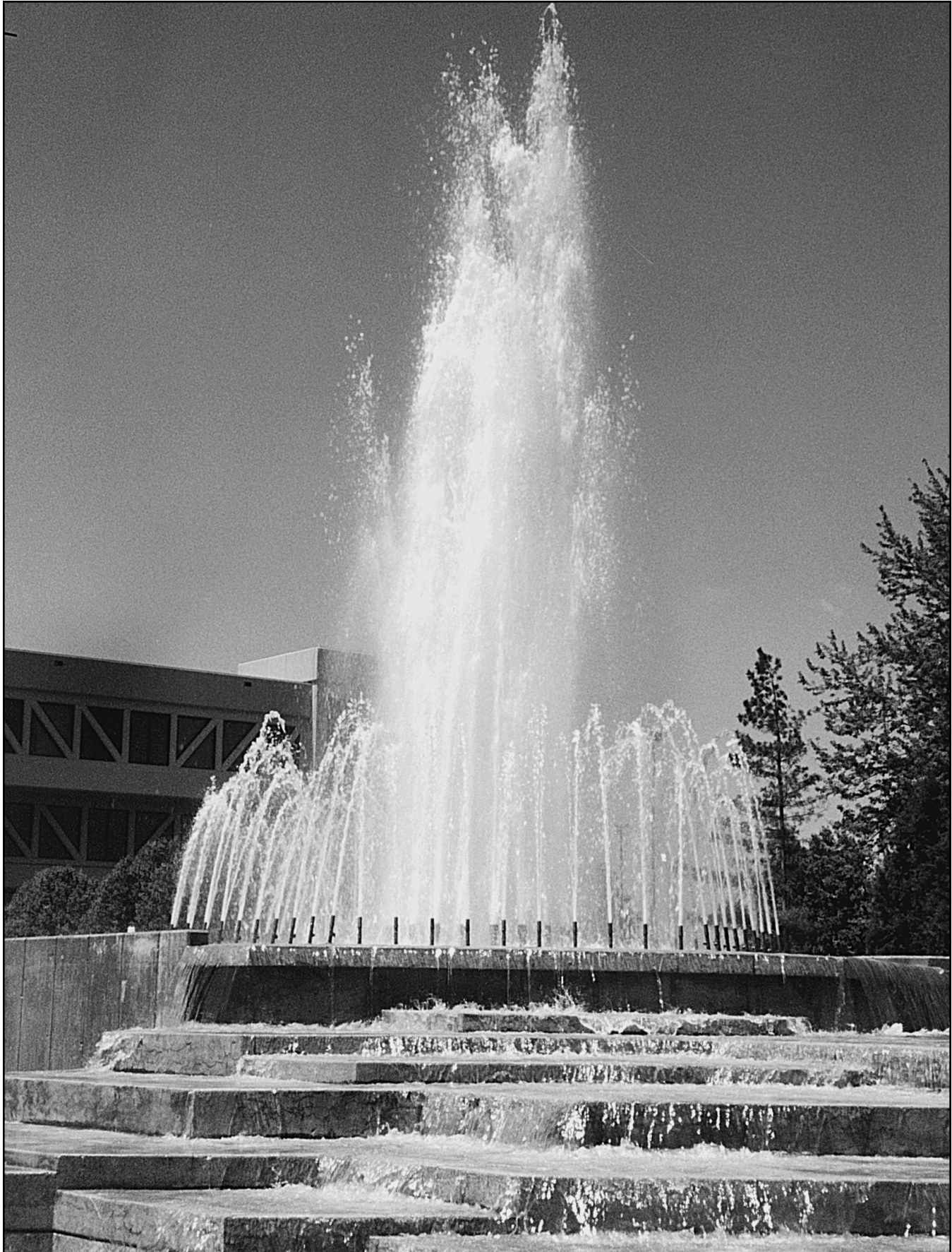
John Q. Hammons Fountain.