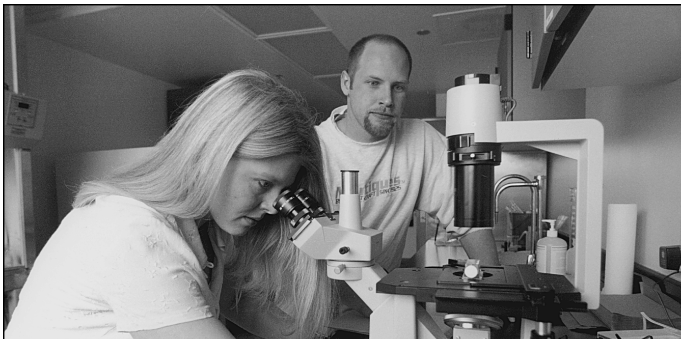
Biomedical Science Laboratory.

110 Professional Building, Phone: 836-4176, FAX: 836-6905 Email: CollegeofHealthandHumanServices@smsu.edu