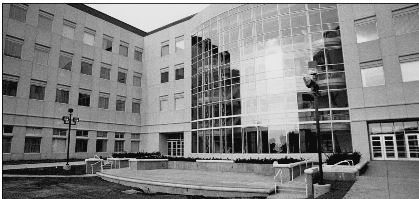
Public Affairs Classroom Building.

251 Public Affairs Classroom Building, Phone: 836-5529, FAX: 836-8472 Email: CollegeofHumanitiesandPublicAffairs@smsu.edu