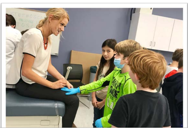
November 2017-Students from Sherwood Elementary visited the MSU PA program to learn how to set up a mock clinic. Didactic year students and faculty shared information about different types of health care providers, medical tools, disease prevention and health promotion.