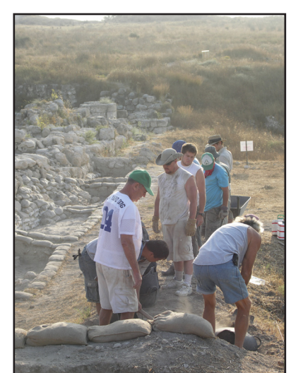
With the city gates as their backdrop, volunteers begin exploring Gezer's forgotton past in the early morning.

From her hand we touched the story of her life.