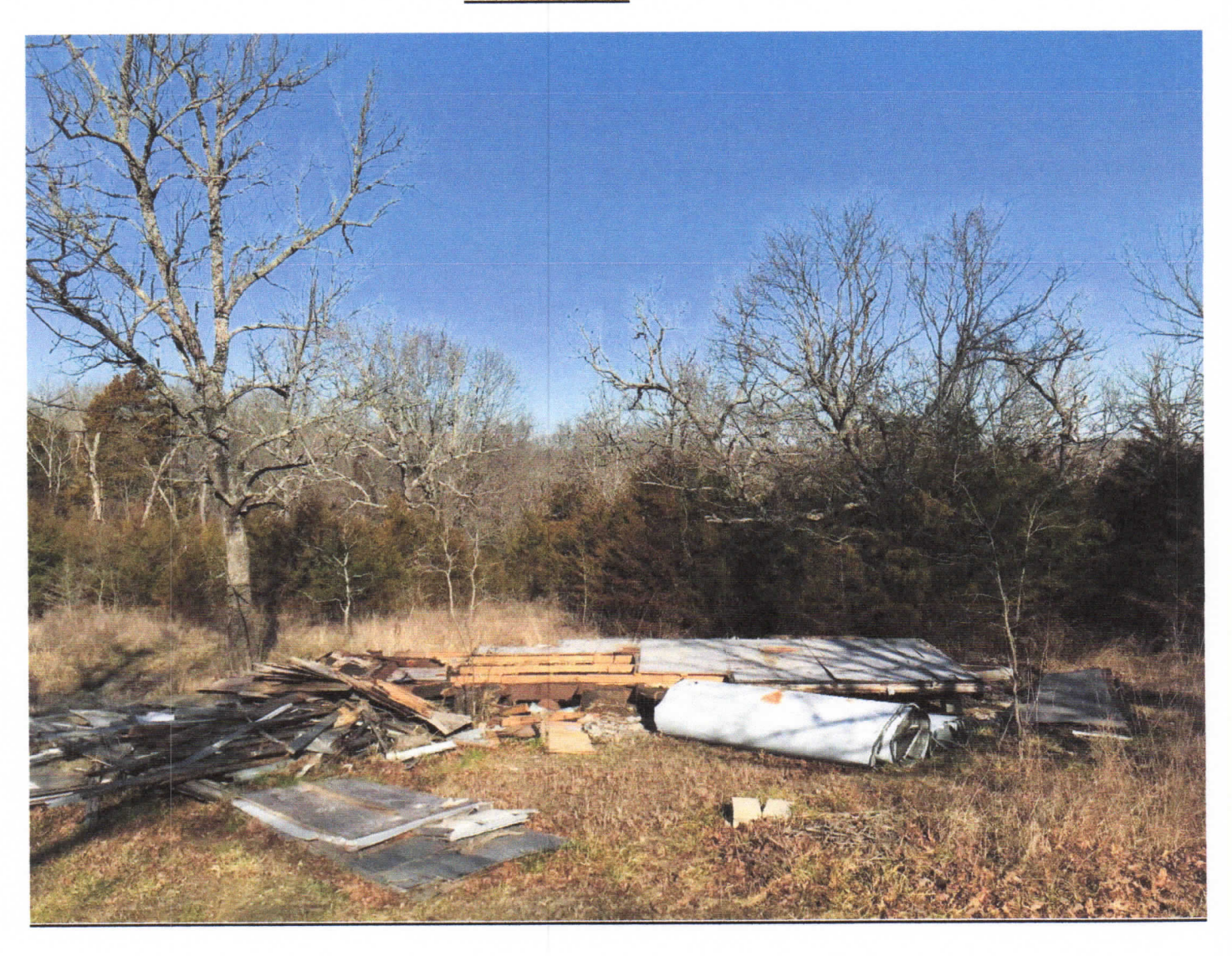
EXHIBIT B TRAILER SITE