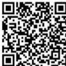
Part of Zone 3