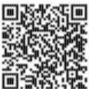
Part of Zone 2