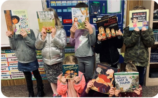
Bilingual and multicultural books for Willow Springs Elementary ELs.

As part of the iELT-Ozarks Project grant, all cohort students implement a family engagement project in their schools. Students focus on family engagement throughout the program. They read and discuss literature on research and best practices, learn more about their families, and plan projects that respond to their needs. This project is carried out in Practicum, which two of our cohort 2 participants and one of our cohort 3 participants completed in spring 2021. Between them, there were a total of three projects, which included a website for EL families, adapting a district Lau Plan, adding bilingual and multicultural books to the school, and a bilingual math night.