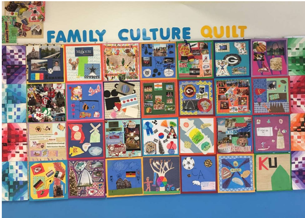
KRISTIN PHEONIX'S WANDA GRAY ELEMENTARY FAMILY ENGAGEMENT ART PROJECT