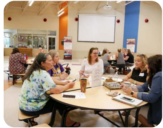
iELT-Ozarks Project cohort 2 students collaborate at orientation.

"I am so thankful to be a part of a program that is a community of educators. The reading, discussions, and resources are already changing the way my classroom looks. I am making connections with students and having such interesting conversations. I so appreciate a program which offers immediate applicability of materials in my classroom!"