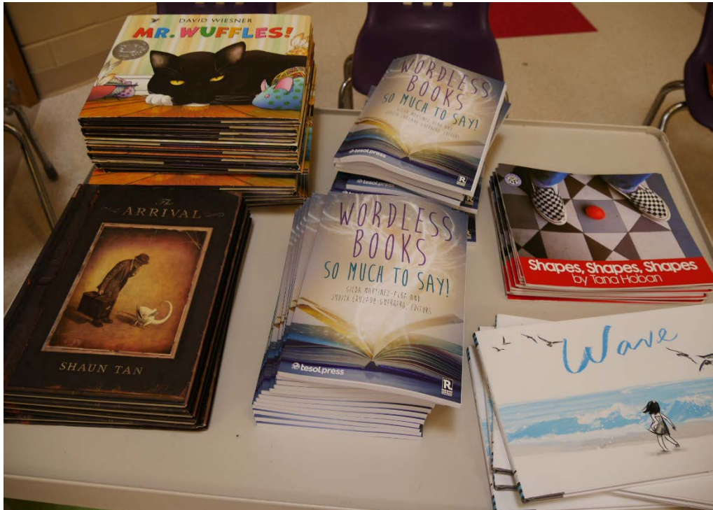
AT ORIENTATIONS PARTICIPANTS EXPLORE TEACHING WITH WORDLESS BOOKS