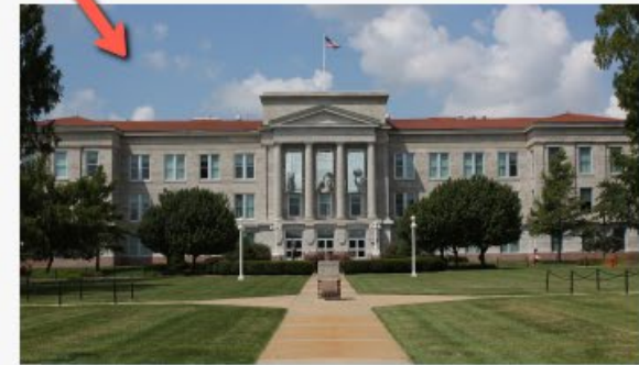
Faculty and Staff