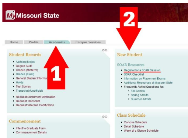
Figure 1: The My Missouri State Portal Screen

If the New Student channel is not available to you, you may not be required to attend SOAR—contact the SOAR office for further assistance.