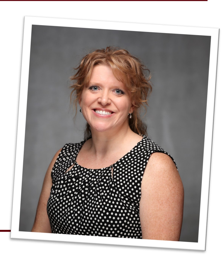
Fall 2021 Honorees