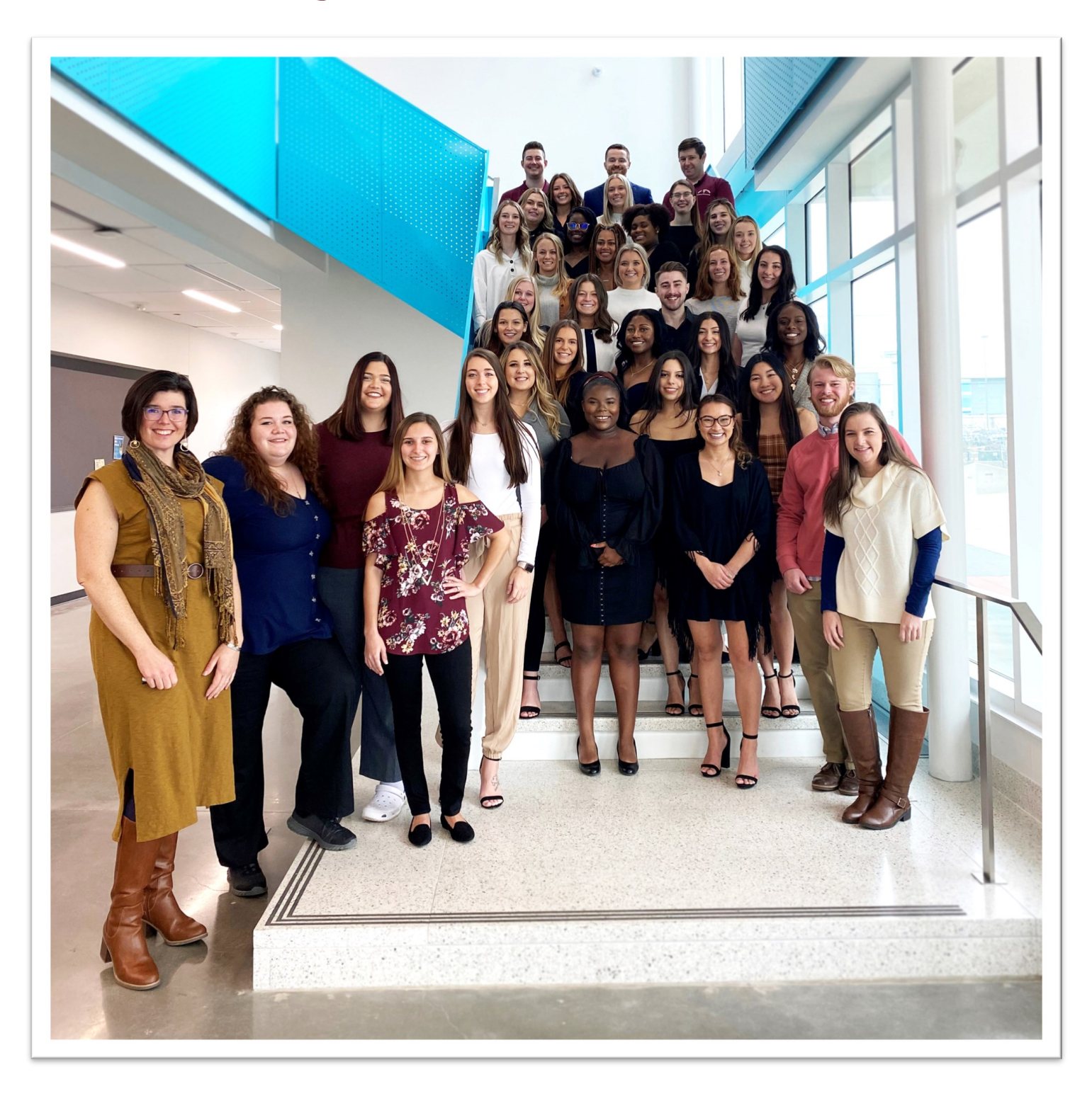
Fall 2021 BSN Graduates